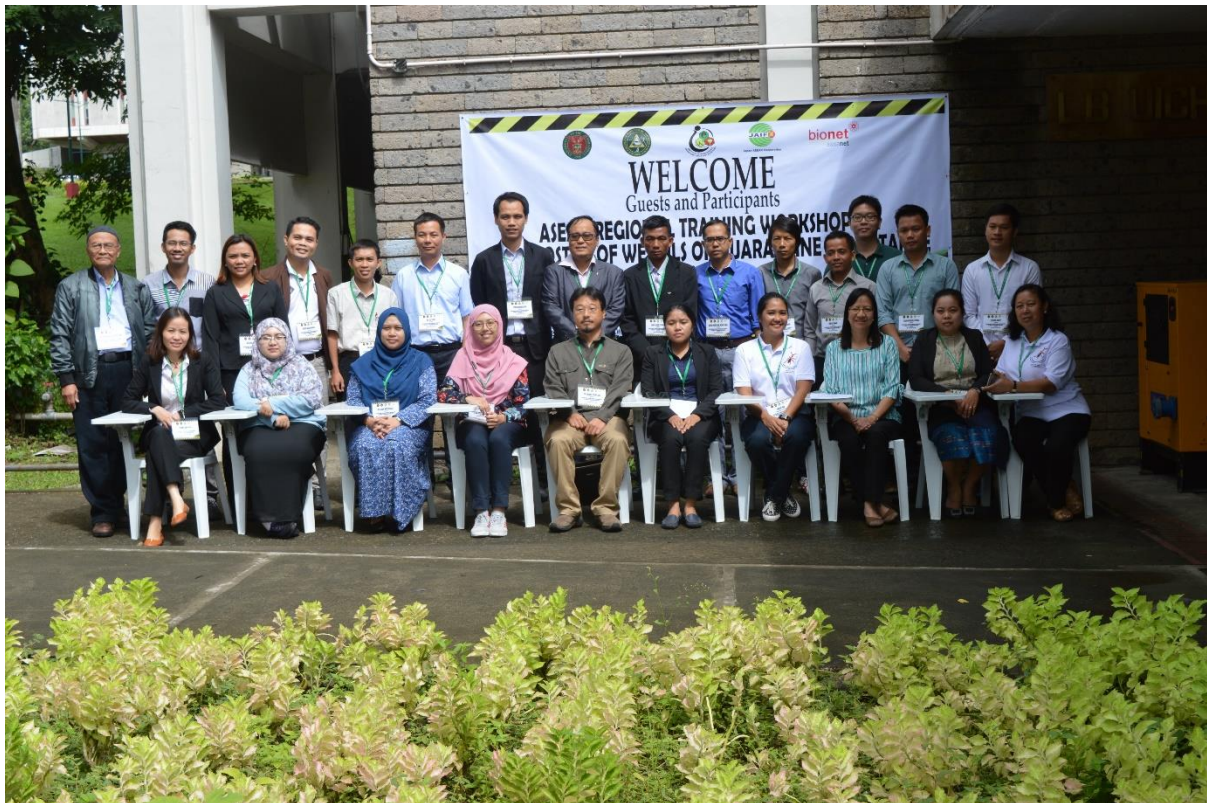
Figure 1. Group photo taken at the IWEP, University of the Philippines, Los Baños, Philippines on July 10, 2017.

Before the day one of the training ends, a welcome dinner for the participants was held at Kamayan, Bay, Laguna to showcase diversity in Filipino cuisines showcasing the famous delicacies in the country like Buko pie (a traditional Filipino baked of young coconut with custard pie) and balut ( a developing duck embryo that is boiled and eaten from the shell).