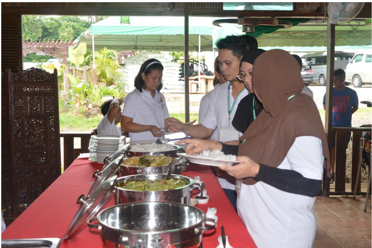
Figure 34. Picture taken during lunch at the Luncheon Hall of APA Farms.