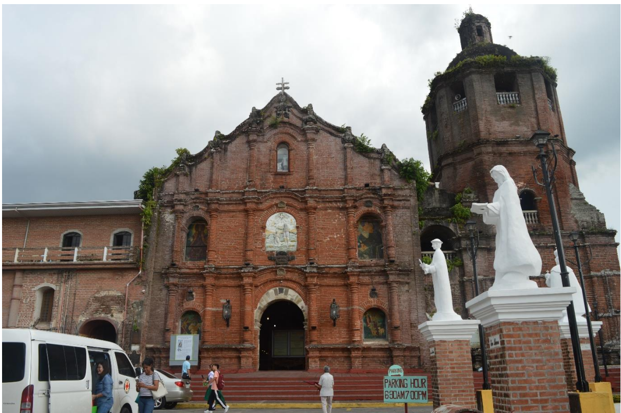
Figure 40. A century old Catholic church located at Liliw, Laguna.