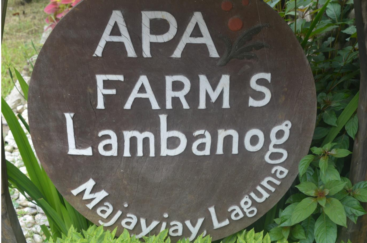
Figure 30. Trademark logo of APA Farms, Majayjay, Laguna.