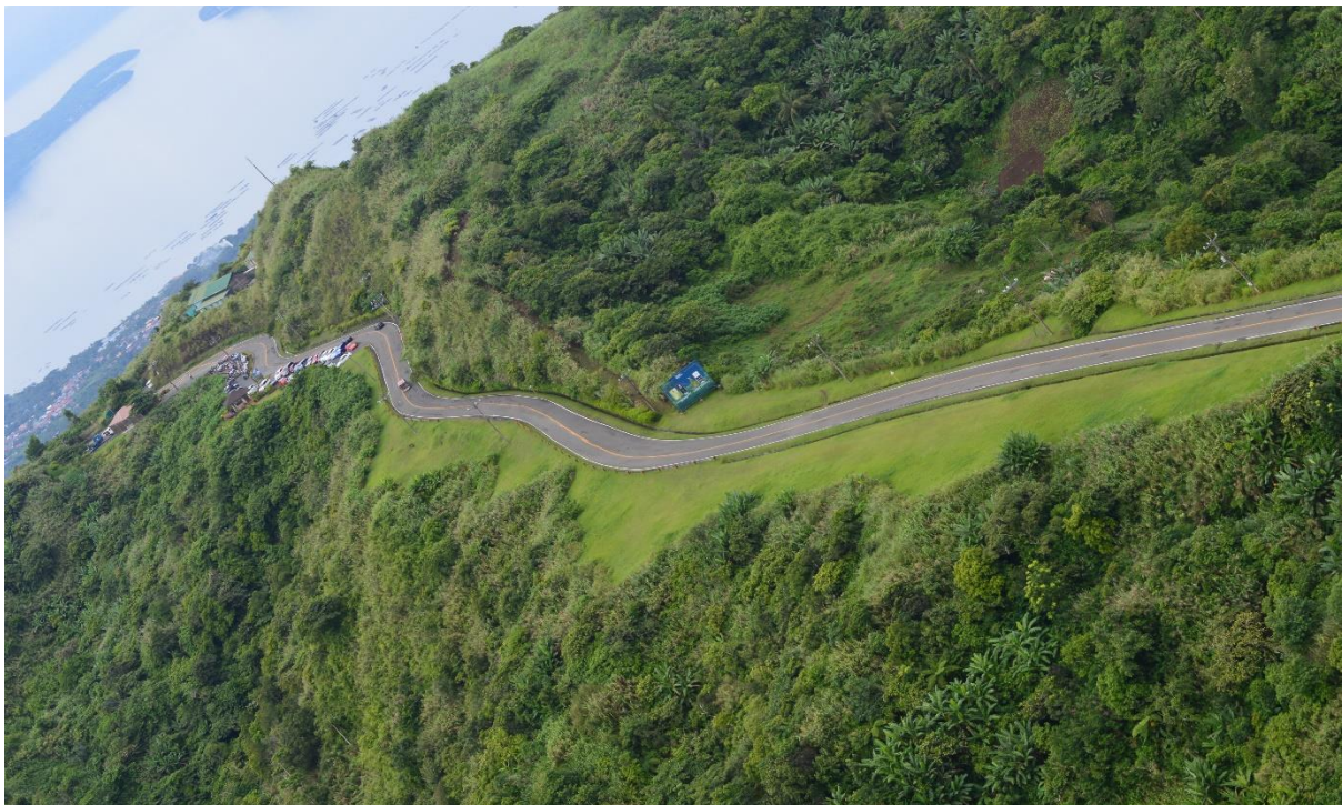
Figure 45. Tagaytay-Talisay road with some steep sections with serpentine twists and turns.