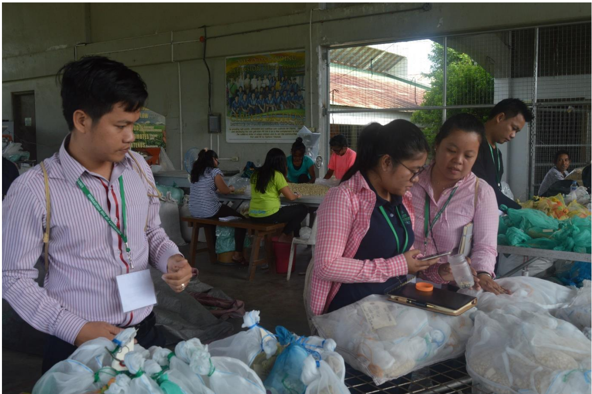
Figure 20. Weevils field collection at the corn storage of IPB.