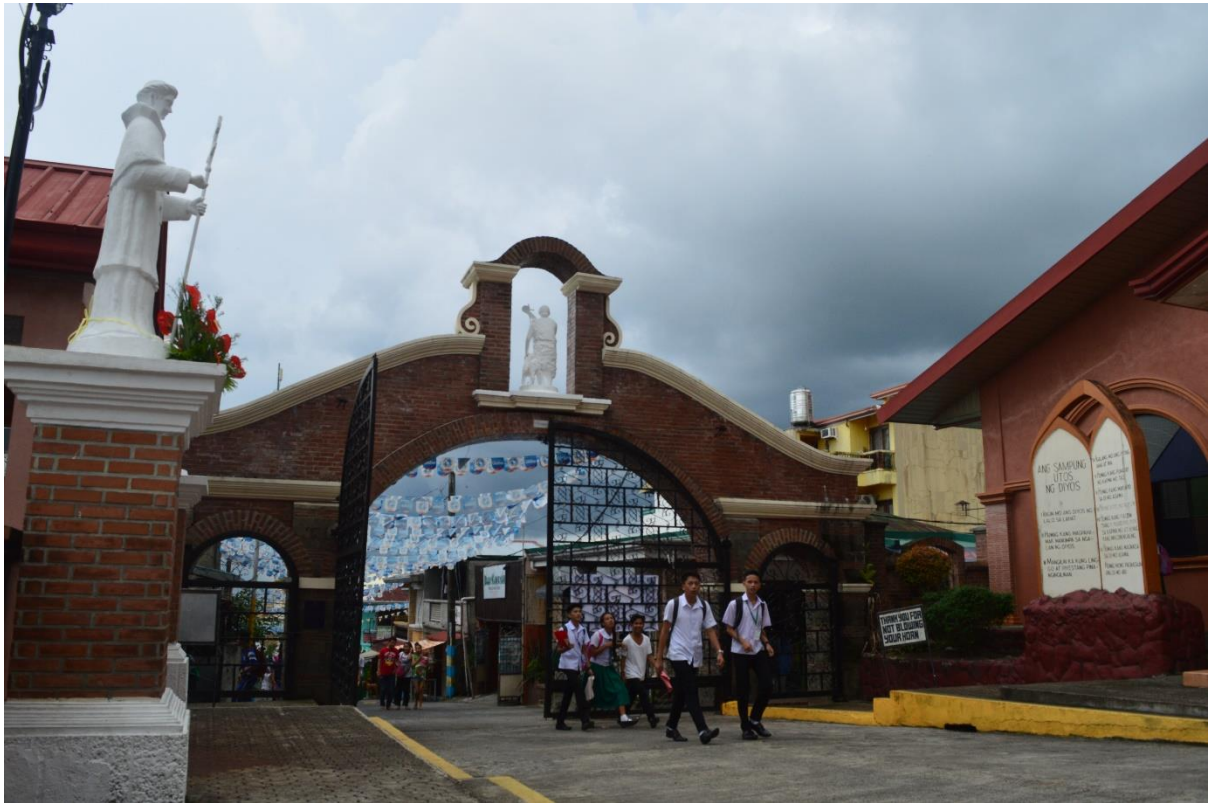
Figure 39. Sightseeing at the Liliw, Laguna, a shoe capital in Laguna Province.