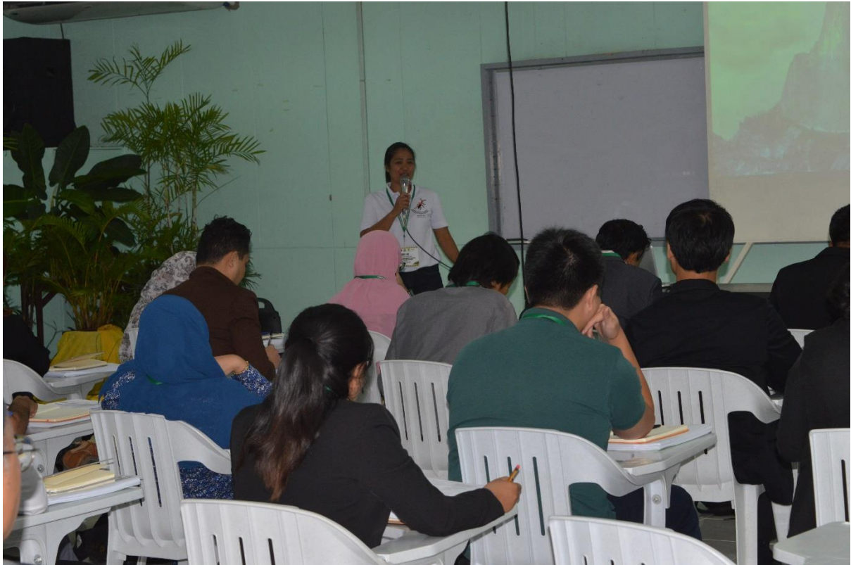
Figure 4. Dr. Yap formally introducing the 19 participants, resource speakers and the training team.