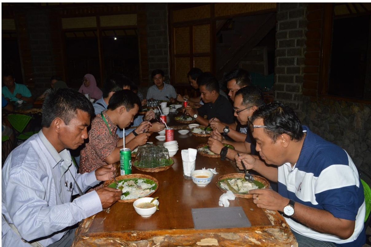
Figure 7. Welcome dinner reception for the training participants held at Kamayan, Bay, Laguna.