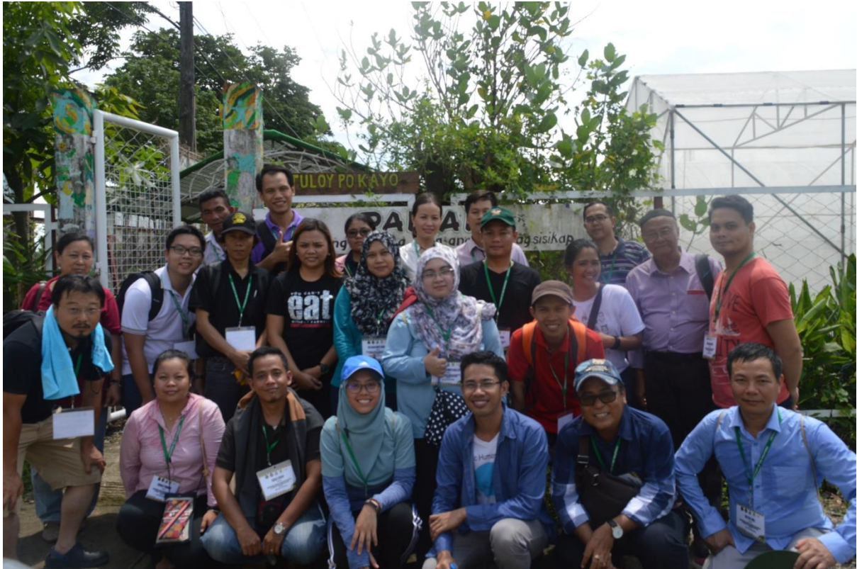
Figure 24. Group picture taken after the trip in PAMANA, UPLB.