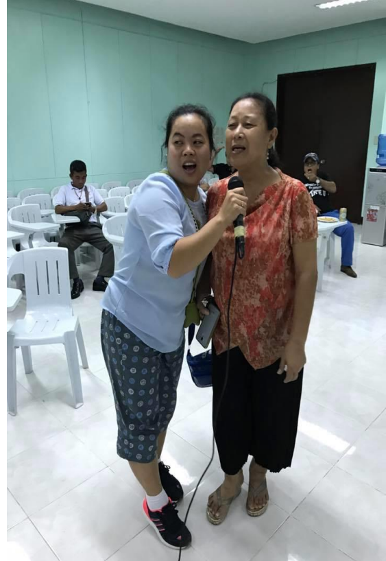
Figure 68. Videoke session during social night held at IWEP, Auditorium, UPLB.