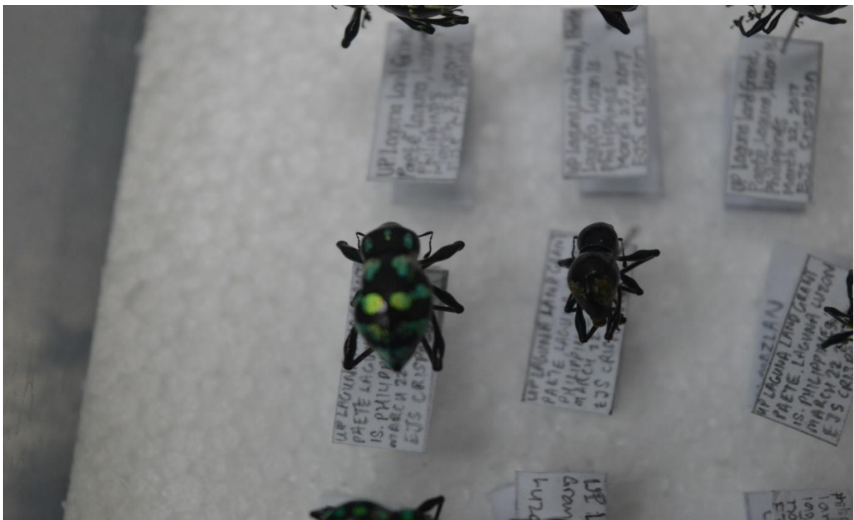
Figure 55. Sample finished output of proper insect labelling done by the participants.