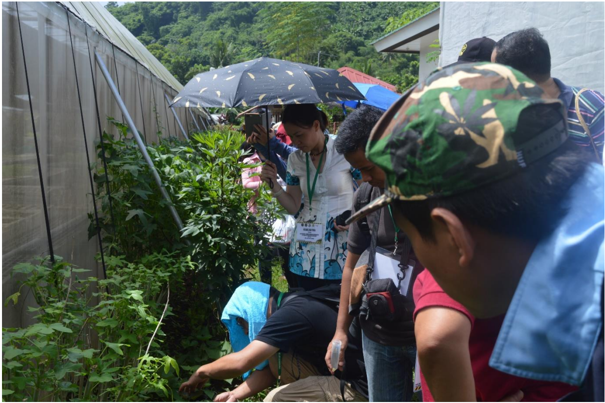
Figure 23. Participants collecting some Cyclas formicarius , a sweet potato weevil using pheromone trapping at PAMANA, UPLB.