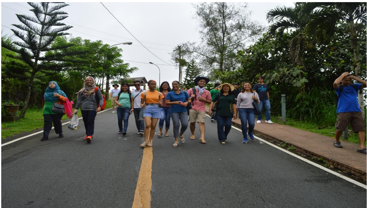
Figure 43. Walking detour along the streets of Tagaytay.