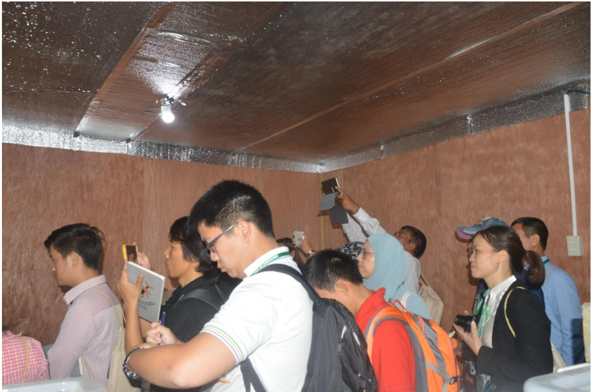
Figure 19. Participant's visit at the corn storage facility in IPB, UPLB.