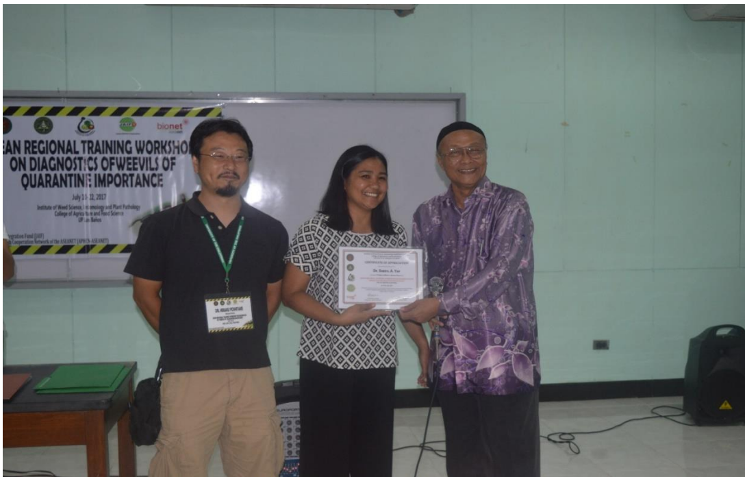
Figure 67. Awarding of certificate to the resource persons held at the IWEP Auditorium, UPLB.