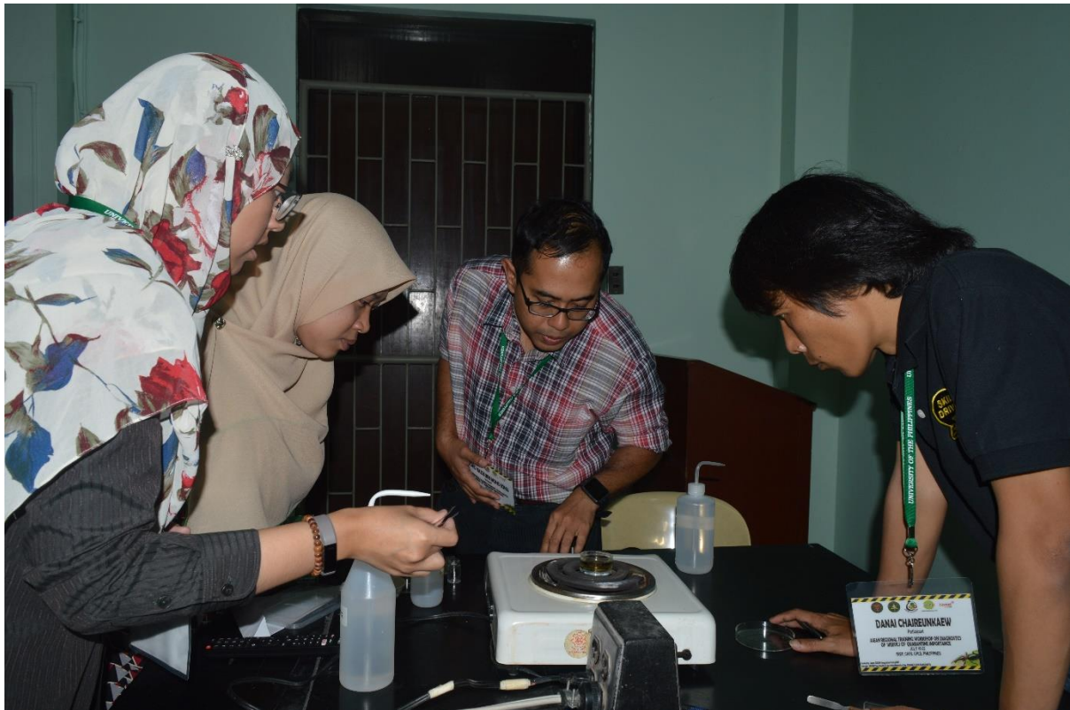
Figure 52. Participants doing maceration techniques using chemicals like KOH.