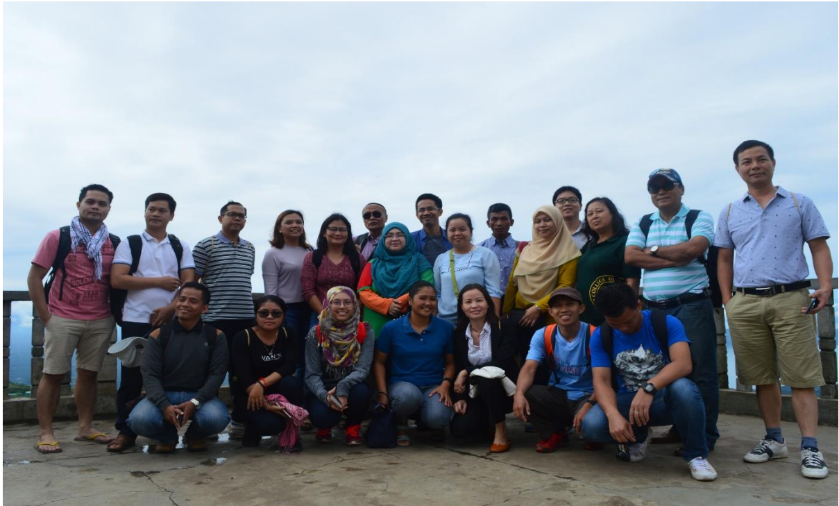
Figure 42. Group photo taken during the sightseeing tour at Mt. Taal in Tagaytay.