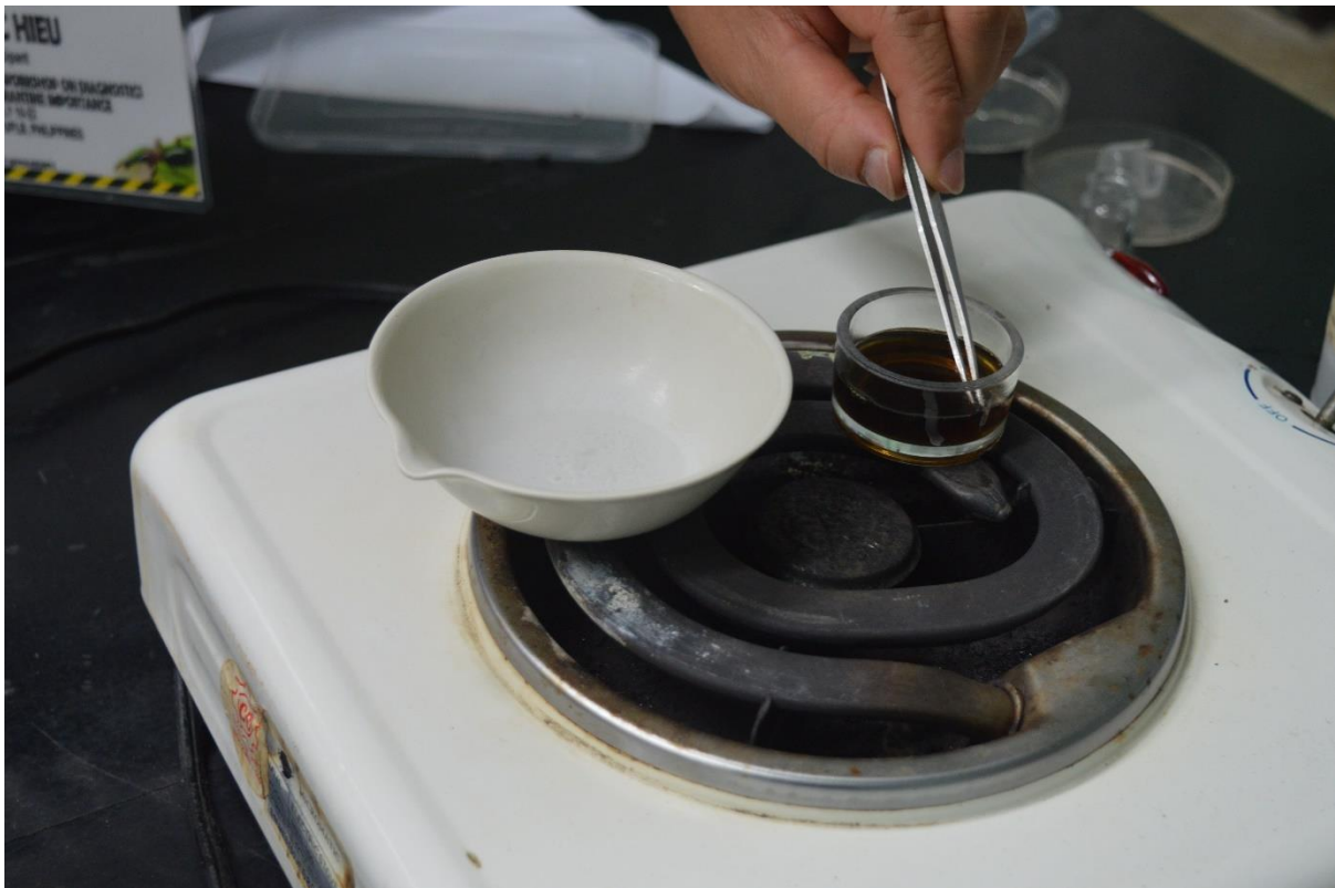
Figure 51. Sample experimentation setup on the maceration of insect dead bodies using chemicals like KOH.

Participants are expected to be able to do and master the tasks mentioned above since it is a basic entomological technique.