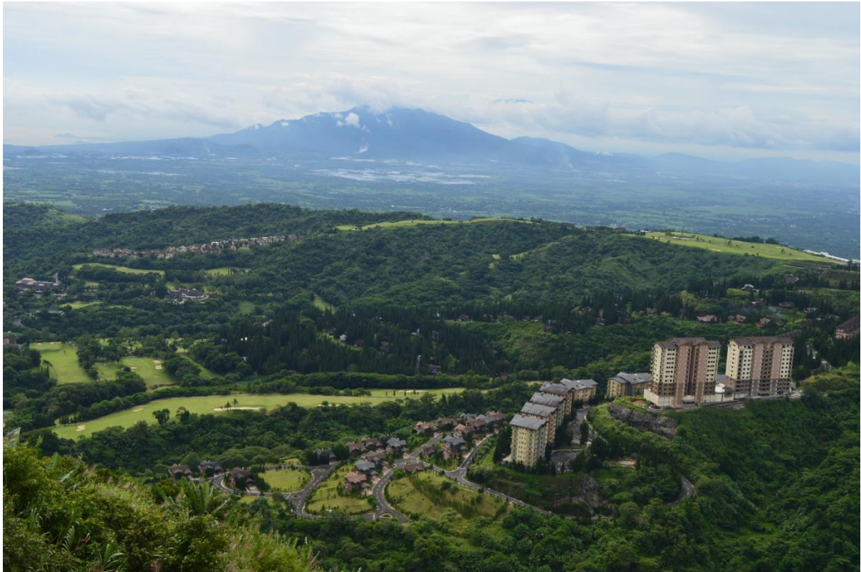
Figure 44. Surreal view of Tagaytay taken above.