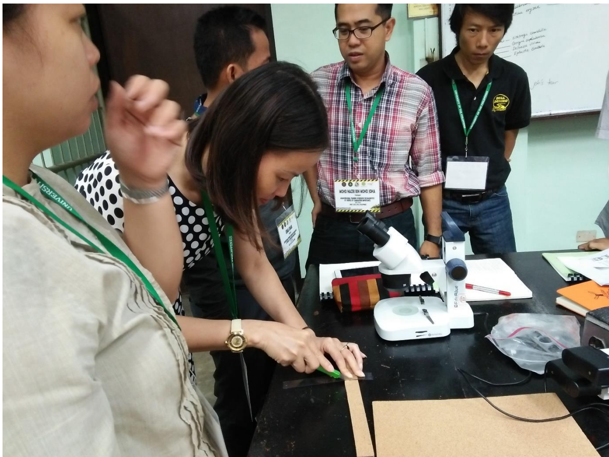
Figure 53. Participants cutting some board to make an improvised pinning stage.