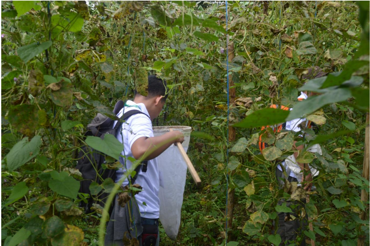
Figure 37. Picture taken during field collection in a vegetable farm at Majayjay, Laguna.