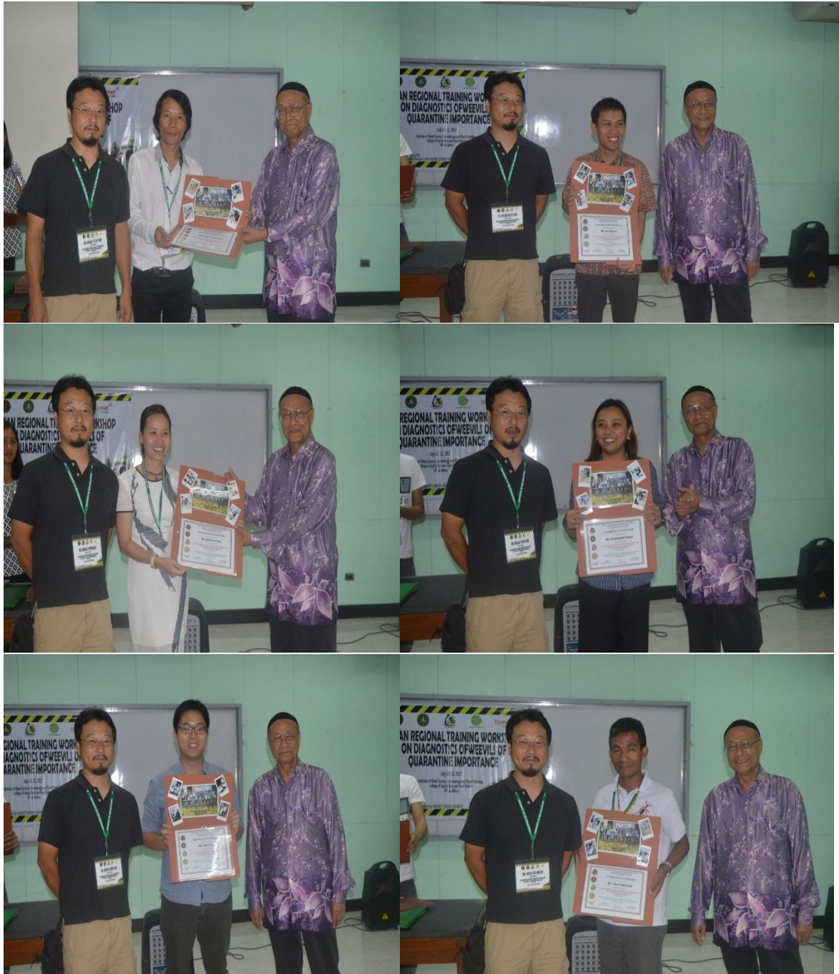
Figure 66. Awarding of certificates to the 19 participants held at IWEP Auditorium, UPLB.