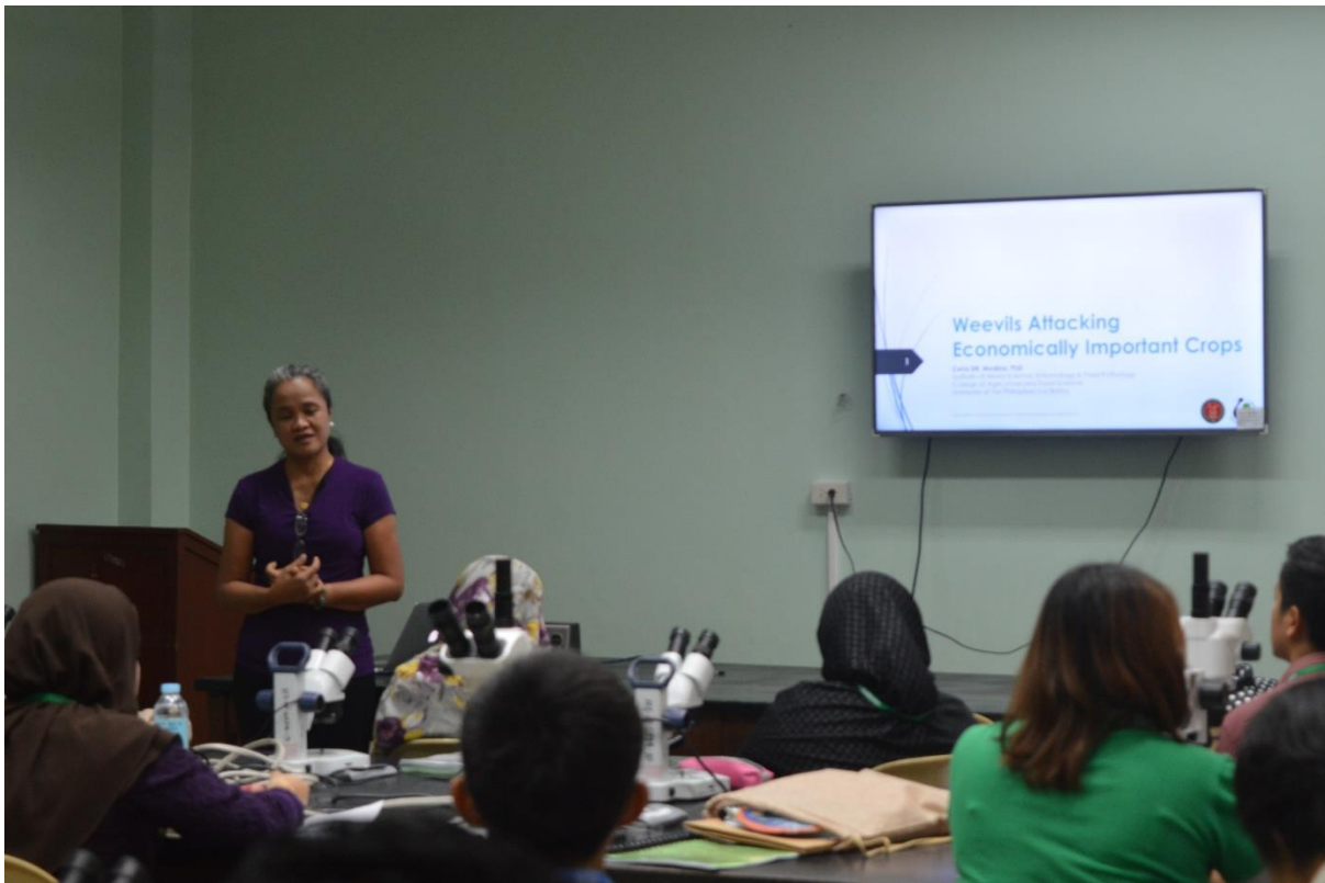
Figure 11. Dr. Medina discussing the common weevils attacking economically important crops.

In the afternoon session, participants were tasked to perform identification of weevils in agricultural crops by using the sample specimen brought by Dr. Medina and her team. Each participants also performed dissection of genitalia.