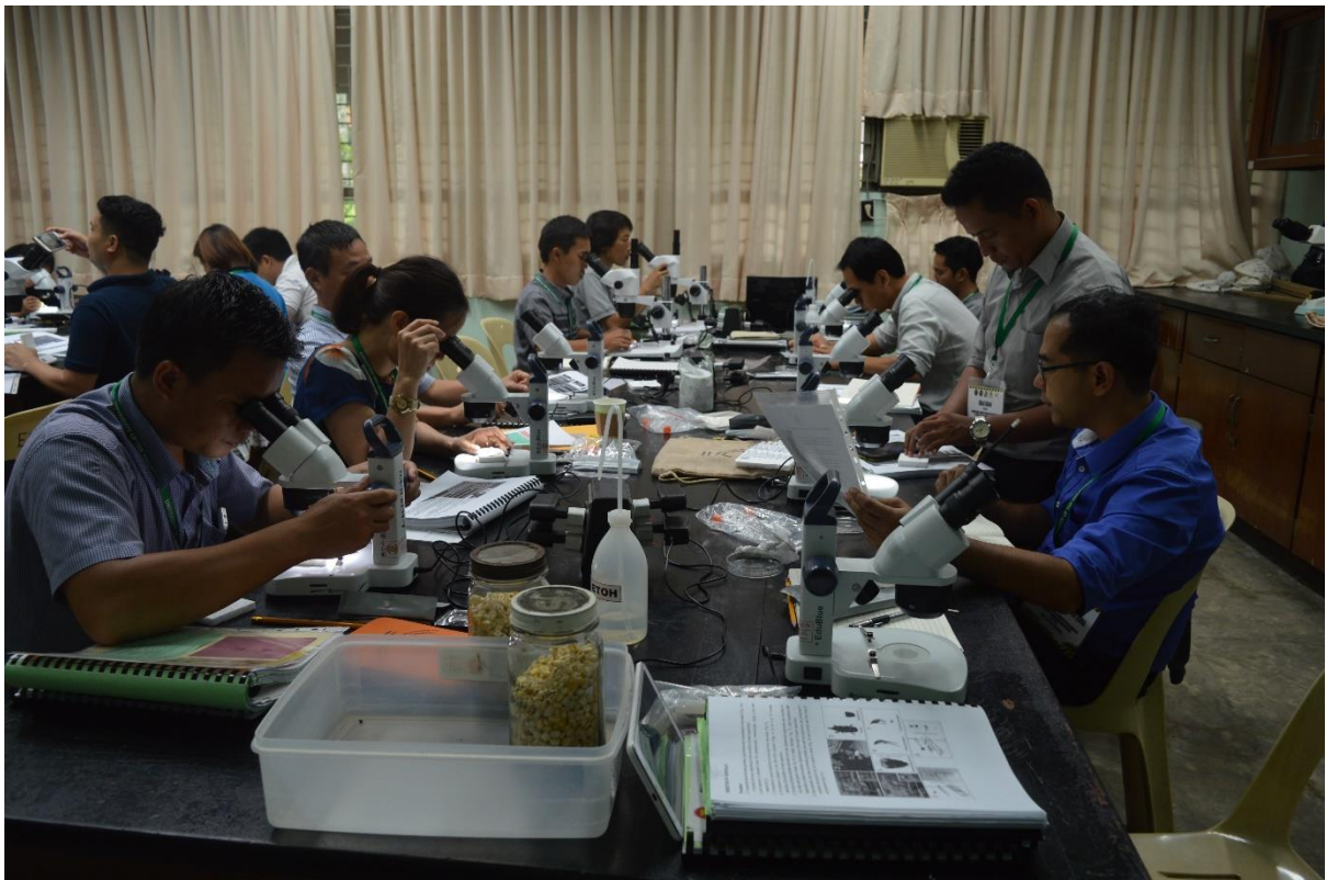
Figure 48. Picture taken during the laboratory work on the identification of storage pest.