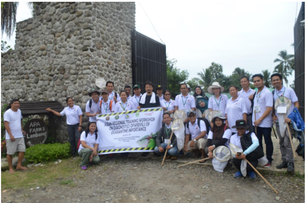
Figure 38. Group photo taken after collection trip at the APA Farms, Majayjay, Laguna.