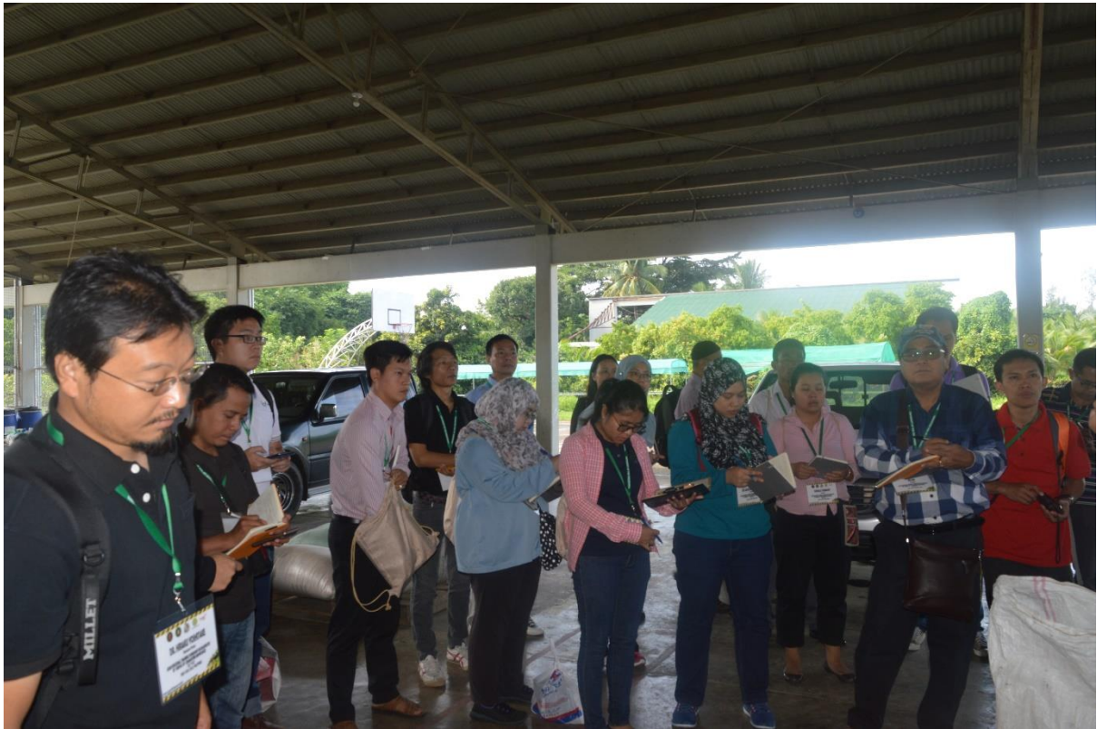
Figure 17. Thorough exchange of discussion regarding corn grits and some weevils infesting corn.

rice. Not only that, the museum also exhibits the important role of rice as cereal in feeding billions of people.